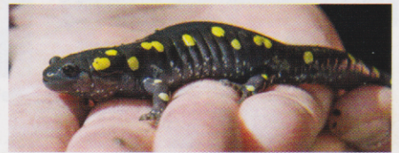
LEFT: A rattlesnake brought by the Cape Ann Vernal Pond Team. ABOVE: A 1-year-old yellow spotted salamander, an amphibian that can be found in wet areas on Cape Ann.