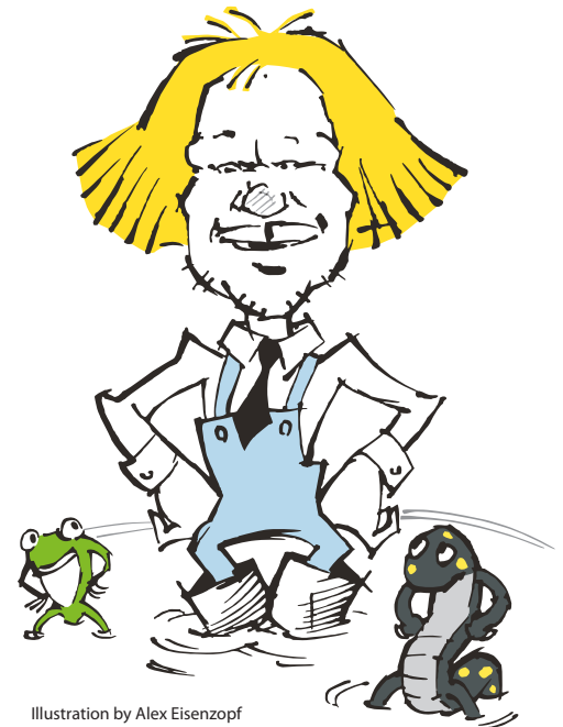
Illustration by Alex Eisenzopf

Throughout these 32 years we've certified over 300 ponds and worked to protect wildlife habitat. This year we worked on applications with the MA Natural Heritage and Endangered Species Program. The vernal pond certification reporting process entails collecting data in the field. It includes photographs of the pond full of water in the Spring, evidence of obligate species - usually wood frog or spotted salamander egg masses and a description of the pool in terms of length, width, depth and location - GPS coordinates. Field work and documentation is completed by our Team.